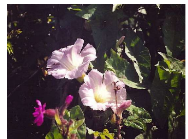
Pink hedge bindweed