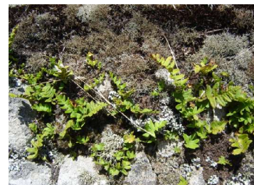
Polypody fern and lichens

Peltigira canina - Dog lichen Parmelia saxatilis - Crottle Cladonia pyxidata - Cup lichen Lecanora atra - Black Shields Ochrolechia parella - Crab's-eye lichen Homalothecium sericeum - Silky Wall Feather-moss Dicranum scoparium - Broom's Fork-moss Hypnum cupressiforme - Cypress-leaved Plait-moss Campylopus introflexus - Heath Star Moss Polytrichum formosum - Bank Haircap Grimmia tricophylla - Hair-pointed Grimmia Polypodium vulgare - Common Polypody Sedum anglicum - English stonecrop