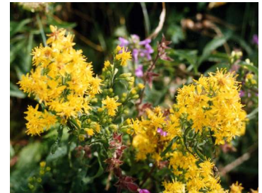
Wild golden rod