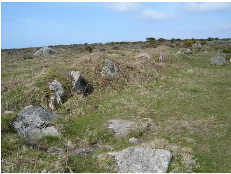
Iron Age hedge.

time. Also, it is likely that some original basic layouts of stitches were modified with their hedges and cottages as time went on. So the hedges around stitches may be from the bronze age, post-Roman or Tudor periods, or somewhere in between. The rare gold hoard of the middle bronze age (c. 1200 BC) from Amalveor, in Penwith, was discovered in a Cornish hedge which formed part of an already extensive field system. Answers may come when the modern ways of dating prehistoric remains are used to date things found under the bottom of hedges.