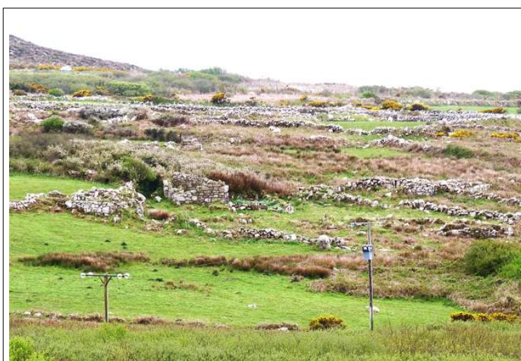
Remains of the tiny fields of a prehistoric farm at Lower Porthmeor.

The small size of the fields allowed them to be rooted over by pigs, almost as good as ploughing. The Cornish word sogh signifies both 'pig snout' and 'tip of ploughshare'. Cattle, brought in from the open land outside the fields, were put into a field for night protection. Their feet 'poached' the land and their dung and urine manured it, bringing goodness and fertility from the common on to the field. The modern farmer uses a similar technique in reclaiming land by