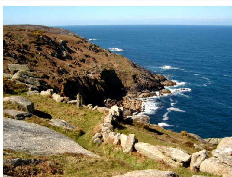
Bronze Age stone hedge built to prevent livestock from falling over the cliff.

summer there, grazing the livestock on the grass which was growing there with the warmer weather. Then they grazed their way back to the coast again in the autumn.