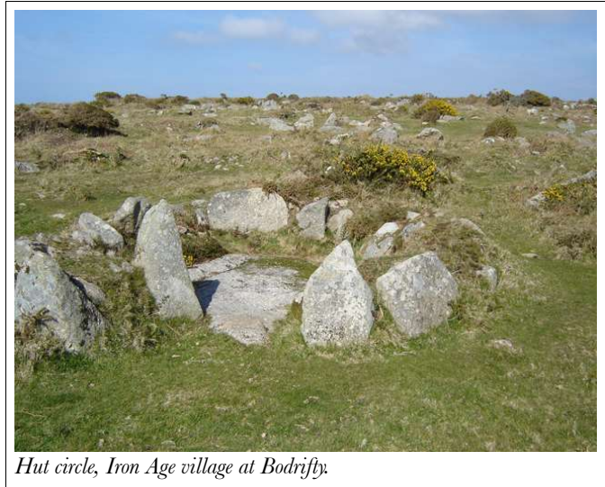
Hut circle, Iron Age village at Bodrifty.

huts and some of its fields with their stone hedges. Another is Chysauster near Gulval. Maen Castle, near Land's End, appears to have been already farmed to its agricultural margins by 500BC as shown by the hedges, their ruins still being prominent features today. The importance of agriculture was reflected in the illustration of vine-leaves and an ear of wheat or barley on the British gold slater coin of 50 BC.