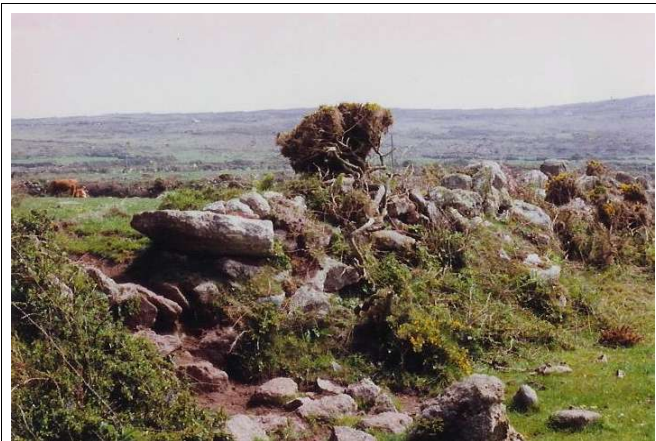
Bronze Age hedge still adequate for Guernsey cattle. Gap needs repair.

News of the invention of the turn-wrest plough, the precursor of the mould-board plough, is likely to have arrived before the Roman occupation. The turn-wrest plough was like the ard, but with an enlarged symmetrical plough-share so that by leaning the plough one way or the other, the soil was pushed to one side or the other. The concept was so useful that the traditional wooden turn-wrest plough was still being used at the Tywardreath ploughing match in 1840. For