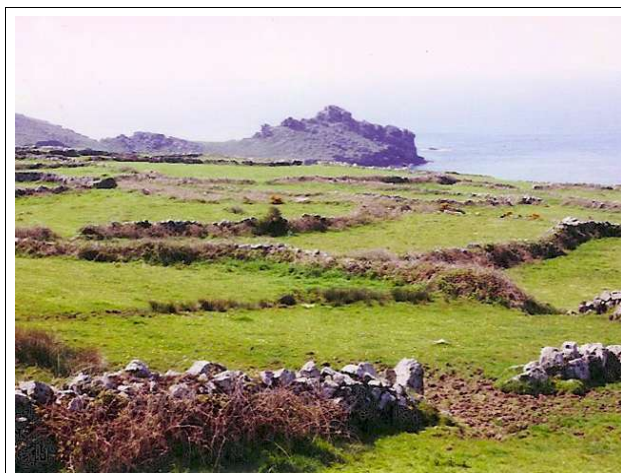
Bronze Age field hedges at Boswednack.

This family pride, passed down from generation to generation, made sure that the heritage in the land and hedges was kept up to scratch. In the same way, the land outside the fields, the common land, was the property of the family as a whole. When the prehistoric farmer's children grew up there were several openings for them. The first was to stay at home, requiring the farm to get bigger or more productive, which often meant building new hedges to subdivide larger fields. The second was to build a house on the outer edge of the farm, and rob the farm of some of its land and common grazing, an alternative which relied on more subdivision and agreement within the extended family. The third was to diversify, to learn another trade such as flint-knapping, and to carry on living at the farm, building another house. The fourth was to make or get a farm near enough to share some of the day-to-day farming problems. The last choice was to leave the family area altogether and, as many Cornish have done ever since, to 'go foreign and get a job'.