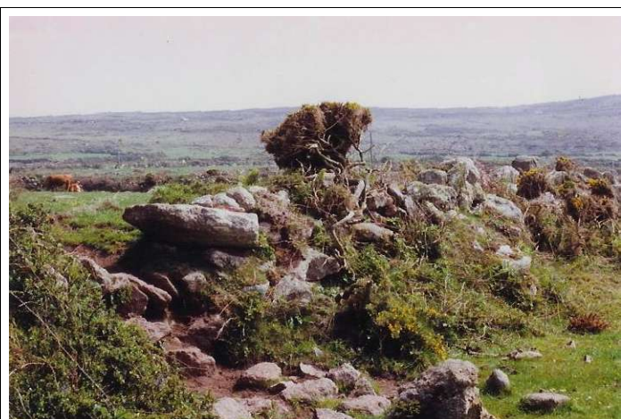
Bronze Age hedge still adequate for Guernsey cattle.

The great question as yet unanswered, on the basis of the reave field system on Dartmoor