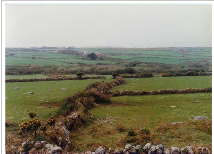
Bronze Age hedge showing kinks where adjoining hedges, once forming the very small rounded fields, have been removed.

at the Tywardreath ploughing match in 1840. For the first time, the plough could be used one-way, as in modern ploughing, instead of criss-crossing the field. Because of the extra effort involved, certainly a pair of oxen at least would have been needed, requiring more room to turn at the ends of the field, so the best way of using the new plough was to have fields that were long and narrow. These were called, in Cornish, lyln or lene , meaning a strip of land. This was later called a stitch by the English and the new name was adopted by the Cornish. Some writers use this word to mean only the plots laid out systematically when the collective arrangement is called stitchmeal . Others use it to describe a plot of about one acre, being often detached from other land. Traces of these prehistoric field systems can often be best identified by looking at aerial photographs, especially those taken with the rising or setting sun.