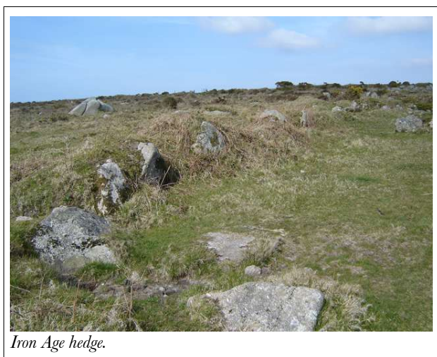
Iron Age hedge.

Most of the hedges between the stiches had a base width of 3ft 6in to 4ft (1m-1.3m), meaning that the hedge was also the same height. This is in fact similar in size to some of the prehistoric hedges in use today, in West Penwith, to keep in traditional Guernsey cows without needing barbed wire. These are small herds of about 40 cows which the farmers are able to train to respect these low hedges in fields, many of which are still less than half an acre (0.5ha-1.0ha) in size, having changed little since prehistoric times. An alternative view is that they were similar to hedges in East Cornwall which are less than 1 metre high and topped with a cut-and-laid thorn hedgerow