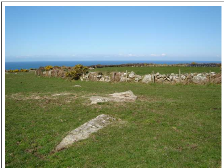
Moor-stone boulders 'rising', with Bronze Age clearance hedge in background.

stones or boulders in the fields. Traditionally they were removed by hand about once every generation, clearing the soil to a depth of about 9 inches (200mm). The author knows, first-hand, of two farms, one in Pembrokeshire and one in Cornwall, on each of which a large coffin-sized granite boulder was described by the farmer, independently, as having risen each year by an average of about a quarter of an inch (5 mm) during their lifetimes. The speed of this rise to the surface, and above it, is faster the more often the land is cultivated over and around the stone. How