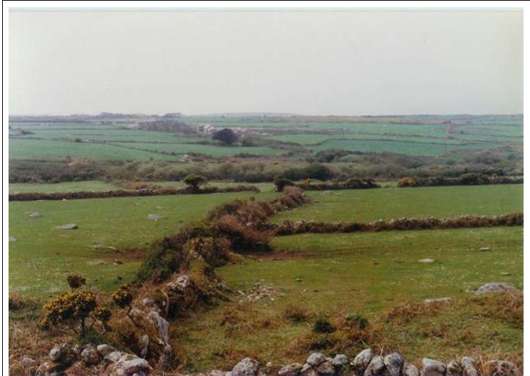
Bronze Age hedge showing kinks where adjoining hedges, once forming the very small rounded fields, have been removed.

now with harder-wearing metal tips, better hoes for weeding the cereal crops and easier sickles for cutting corn. The Cornish shovel got a metal tip, so it lasted longer in hedge building and other work. Use of bronze meant that more fields could be tended by one family within the seasons of the year. It also became worthwhile to cultivate and crop poorer land because less human energy was needed to get a meagre crop, so more fields were taken in and more hedges built. Having separate fields was a form of insurance against crop failures because successive