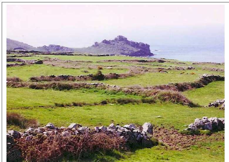
Bronze Age fields at Boswednack.

The Cornish countryside in 2000-1200 BC was cultivated intensively - probably more so than today - in the then warmer climate. Bronze Age remains tell us that the landscape was populated by small hamlets situated about half a mile