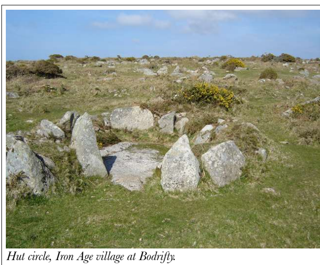
Hut circle, Iron Age village at Bodrifty.

The natural regression of the land to scrub and woodland was prevented by the grazing animals from farms in the nearby lowland. Peat growth was hastened by the wetter climate and this caused impoverishment of the pasture. The natural growth of trees in the abandoned parts of the Cornish landscape was counteracted by the needs from the emerging tin industry, each ton of tin requiring at least ten tons of wood in its production. This resulted in the moorland that we are familiar with today.